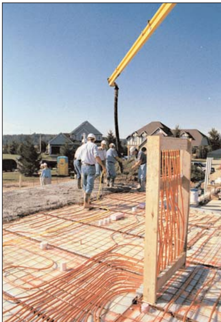
Figure 1. Hydronic radiant floor heating tubing laid out in specific heating pattern prior to concrete pour.

Radiant floor heating is a method of heating your home by applying heat underneath or within the floor. Comparable to warming yourself in the sun, this type of heating warms objects as opposed to raising the temperature of the air.